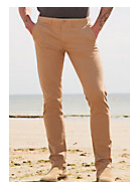
SOL'S JULES MEN - LENGTH 35 02120