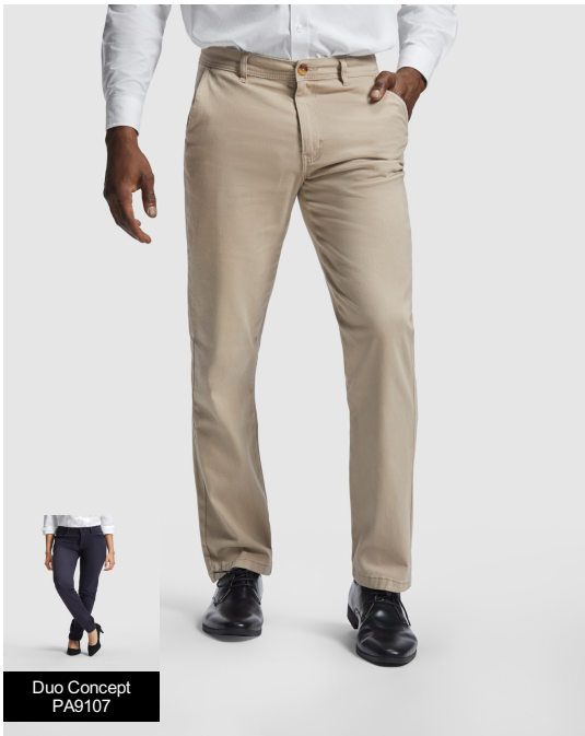
Duo Concept PA9107